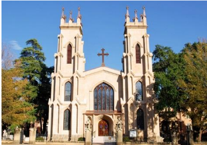
Trinity Episcopal Cathedral

All are welcome to the dialogue – educators, students, volunteers, lay people, clergy and more